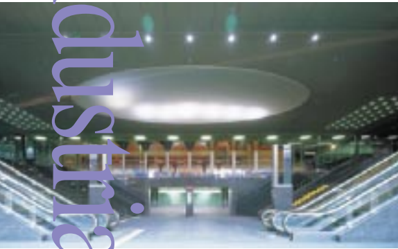
JR Kyoto Station Building