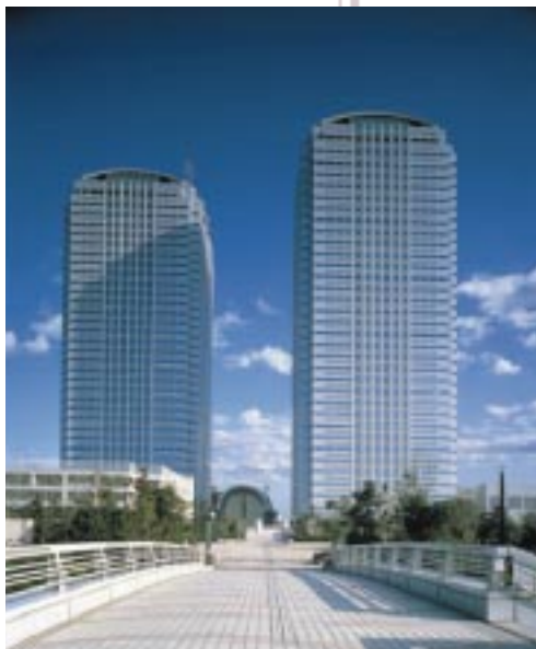
Makuhari World Business Garden