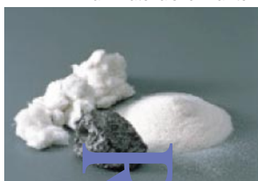
Mineral Fibers and Volcanic Glass, Primary Raw Materials for Dailite

New Concepts, New Technologies, New Materials—Daiken is always at the forefront of the new era.