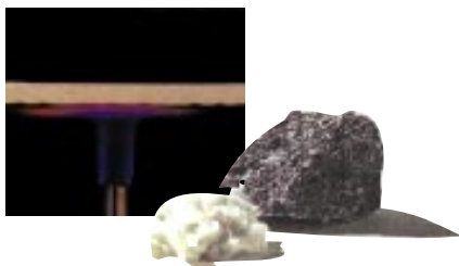
Mineral Fiber Sound Absorbing Panels, Flame Resistant Ceiling Material

Plastic is injected into the pores of wood materials and hardened, creating the new WPC material. This new material offers the strength of plastic combined with the quality appearance of wood.